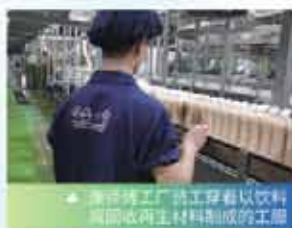
▲ 康师傅工厂员工穿着以饮料瓶回收再生材料制成的工服

近年来，康师傅在可持续发展方面也取得了初步成果：单位产量能耗、水耗和温室气体排放量持续下降，2020年每万箱产品温室气体排放量较2017年下降22%。方便事业蒸箱与油锅烟废气回收项目，每年可减少二氧化碳排放17.3万吨，相当于天津市所有汽车(330万辆)行驶3公里的碳排放量。康师傅空压机组改造项目，年节约7400万度，相当于减少二氧化碳排放约6.8万吨。百饮事业郑州工厂除了将中水用于厂区绿化外，还将中水免费提供给当地市政单位，用于市政草坪浇灌和路面清洁，该工厂2020年节水约4万吨，并为当地社区供水约2万吨，可供一辆道路上常见的东风多利卡洒水车工作满载工作3300余次。