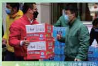
▲ “绿色供应链” 绿色支持 绿色支持行动

康师傅深信「可持续发展才是好发展」，2021年初将企业社会责任委员会升级为可持续发展委员会，由集团董事长、CEO 担任主任委员，由集团经营委员会成员担任委员，下设饮品资源、方便面资源、产品研发、沟通与传播四大工作组，在多个领域实施和推广节能、节水、减碳、减排专案，并新创了PET回收利用、饮料瓶降克重等亮点项目。