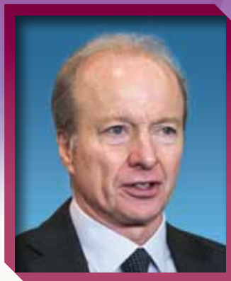
CEO of Securities and Futures Commission 證券及期貨事務監察委員會行政總裁