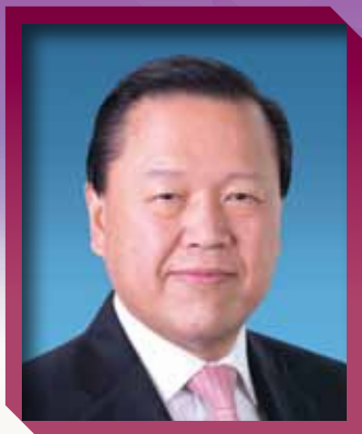
Chairman of Securities and Futures Commission 證券及期貨事務監察委員會主席