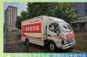
▲ 绿色物流 零碳目标 河南郑州支援行动

康师傅认为制定「碳中和」行动路线是一个科学合理的过程，是一项长期而系统性的工作，企业需要结合其自身整体发展战略制定一套循序渐进的「碳中和」行动和发展计划。我们正在全集团范围内开展全面碳盘查与减碳专案，从而掌握康师傅产品和服务的碳足迹，为后续的减碳目标和路径步骤打下基础。